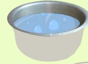
Pot of water